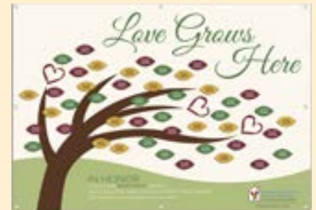
Our "Love Grows Here" donor recognition piece