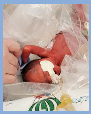
Camille's first day of life