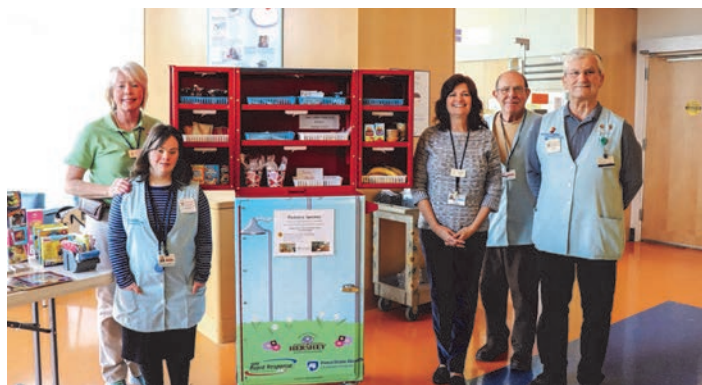
Family Room Staff with the Hospitality Cart

4. How often does the Hospitality Cart visit families? The Hospitality Cart visits the 3 rd , 4 th and 6 th floors twice a day (morning and evening) and provides individual snacks,